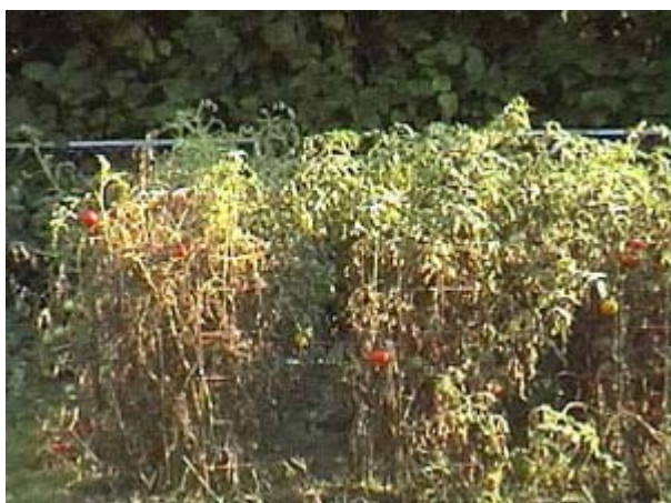
Leaf spot diseases out of control.