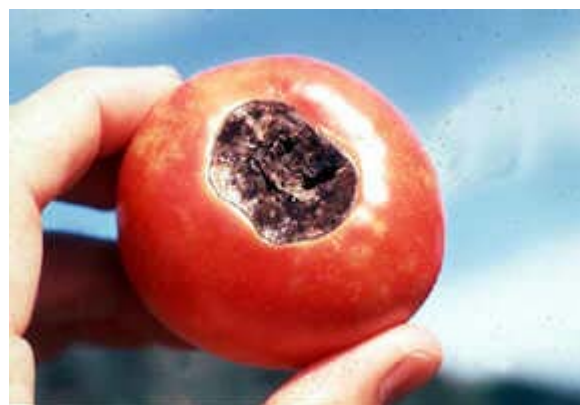
Blossom End Rot