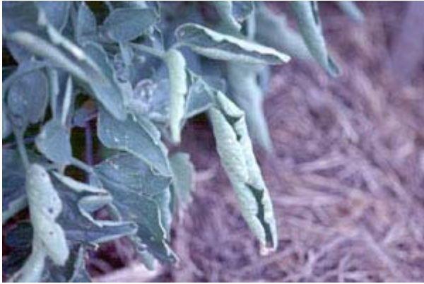
Physiological Leaf Roll