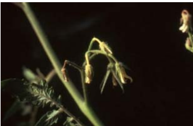
Tomatoes not setting fruit.