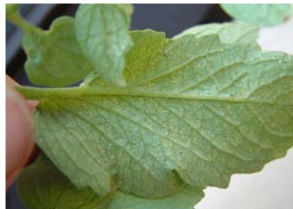
Spider mite damage.