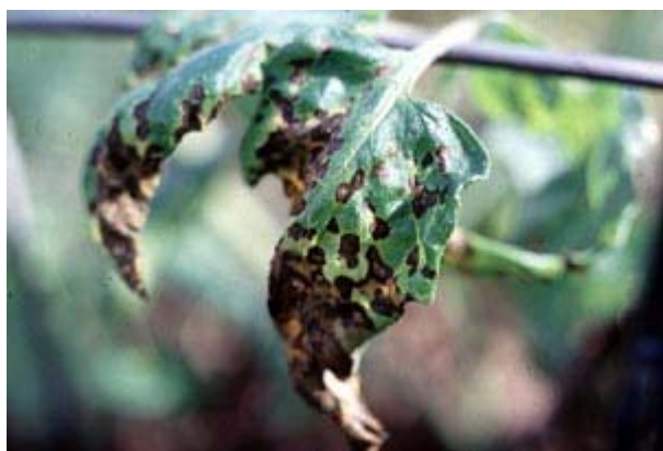
Septoria Leaf Spot