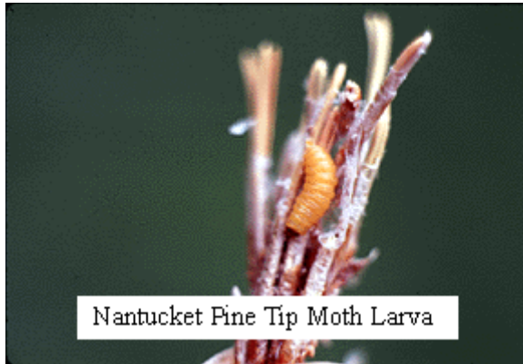
Nantucket Pine Tip Moth Larva