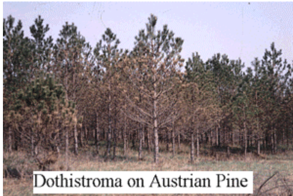
Dothistroma on Austrian Pine