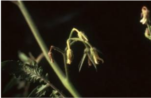
Tomatoes not setting fruit