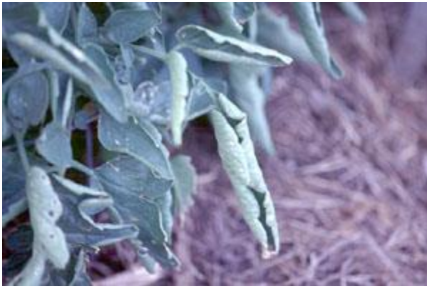
Physiological Leaf Roll