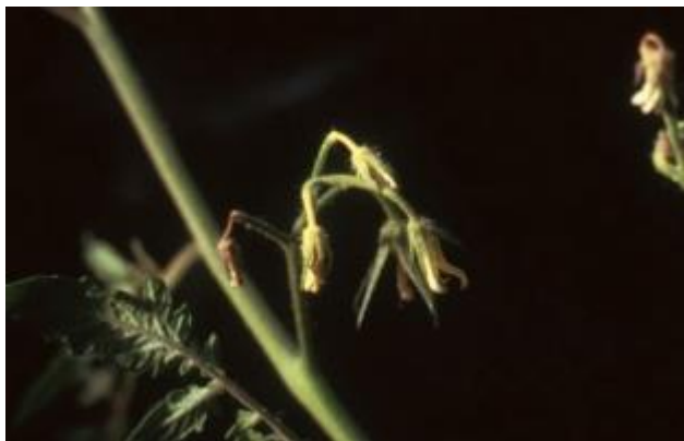
Tomatoes not setting fruit