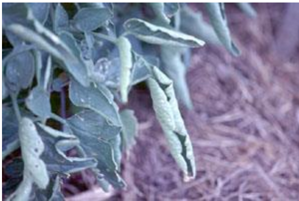
Physiological Leaf Roll