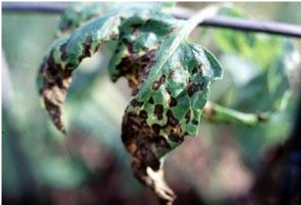
Septoria Leaf Spot