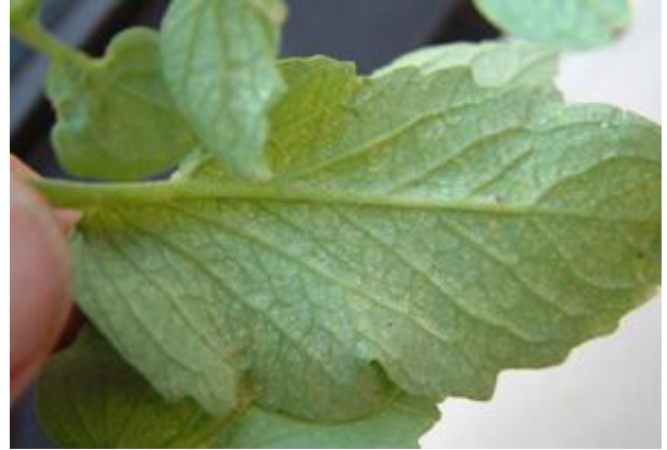
Spider mite damage