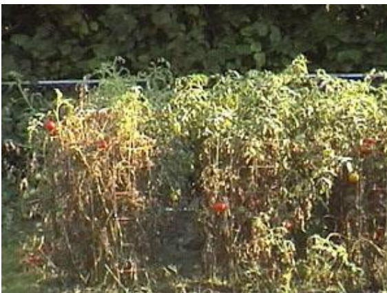
Leaf spot diseases out of control