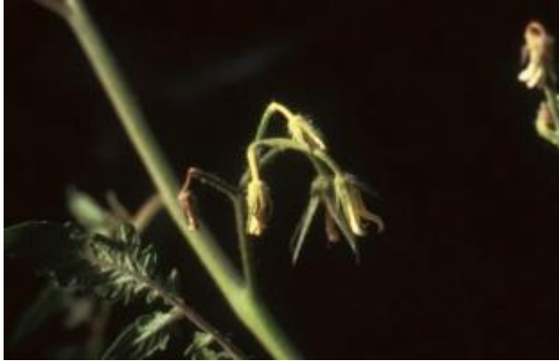
Tomatoes not setting fruit