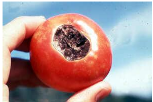
Blossom End Rot